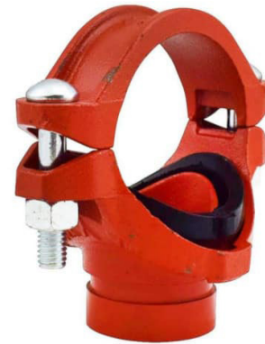
Mechanical Tee Fitting