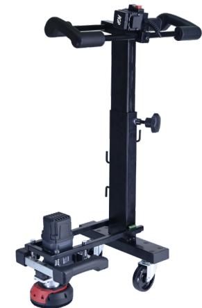
Floor Grinding Trolley

Anti-vibration mountings for maximum operator comfort